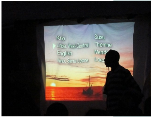
The Jesus film showing in many Sierra Leone tribal languages. Now also available in Fula!

If you want to hear a story about how God has worked in the ministry, check out our blog at http://waemm.wordpress.com/